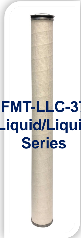
FMT-LLC-37 Liquid/Liquid Series